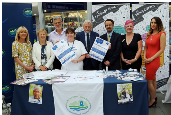
Neath Port Talbot Carers Service with representatives from Neath Port Talbot Local Authority, Abertawe Bro Morgannwg University Health Board and Western Bay Regional Partnership – Carers Week 2018

Swansea Carers Centre have used a portion of the Carers funding made available from Welsh Government to employ a Communication and Information Officer.