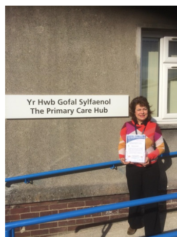
Neath Port Talbot Carers Centre Health Liaison Worker

Neath Port Talbot Carers Service also have contact with the primary care practices in their area and have conducted outreach sessions in 13 centres. The Health Liaison Worker attended all Flu Clinics in the area provides updates to all Practice Managers and updates surgery and practice noticeboards quarterly. This is funded from Integrated Care Fund 2018 -19.