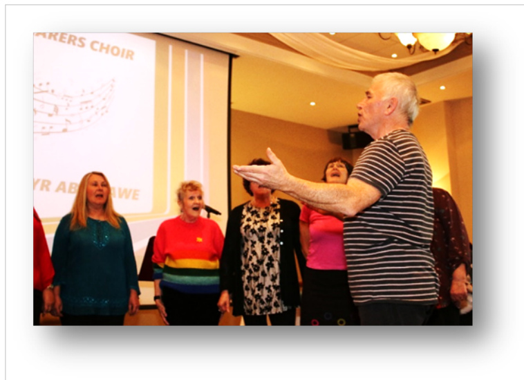
Swansea Carers Choir at the Celebrating Carers Event

Over 100 carers and professionals from across Western Bay came together at the Towers Hotel on the 4 th March. The focus of the day was celebration; to acknowledge and celebrate local Carers who make such a difference to the lives of the people they support, to celebrate new and innovating services which see health, local authorities and Carers Centres/ Service working together to support carers and to celebrate individuals who carers have nominated as having 'gone above and beyond'. The chair of Abertawe Bro Morgannwg University Health Board chaired the event.